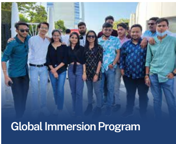
Global Immersion Program

We aim to help students become the best version of themselves with social events on campus, student-led clubs and activities.