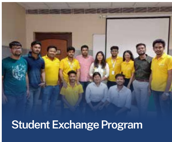
Student Exchange Program